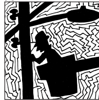
pag. 8 LA VIGNETTA CELATA