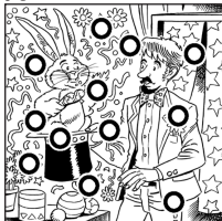
pag. 2 LE DODICI DIFFERENZE